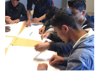
Artistic workshop with mentally disabled children, young refugees & engineering students